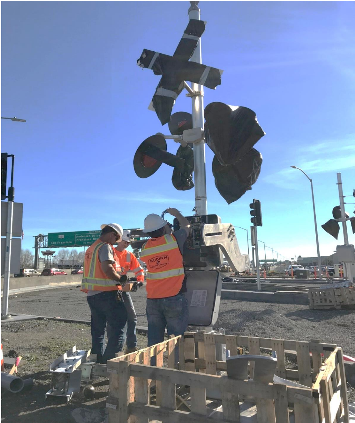
Install crossing signal gates at the Francisco Blvd.