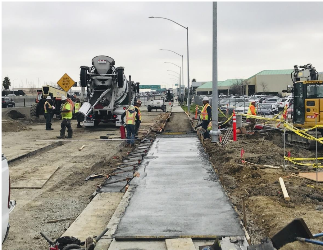
Constructing sidewalk along the Rice Drive