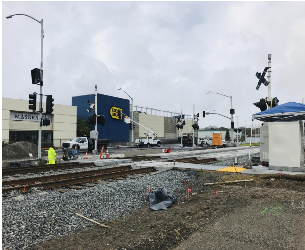
Rice Drive- traffic signal installation