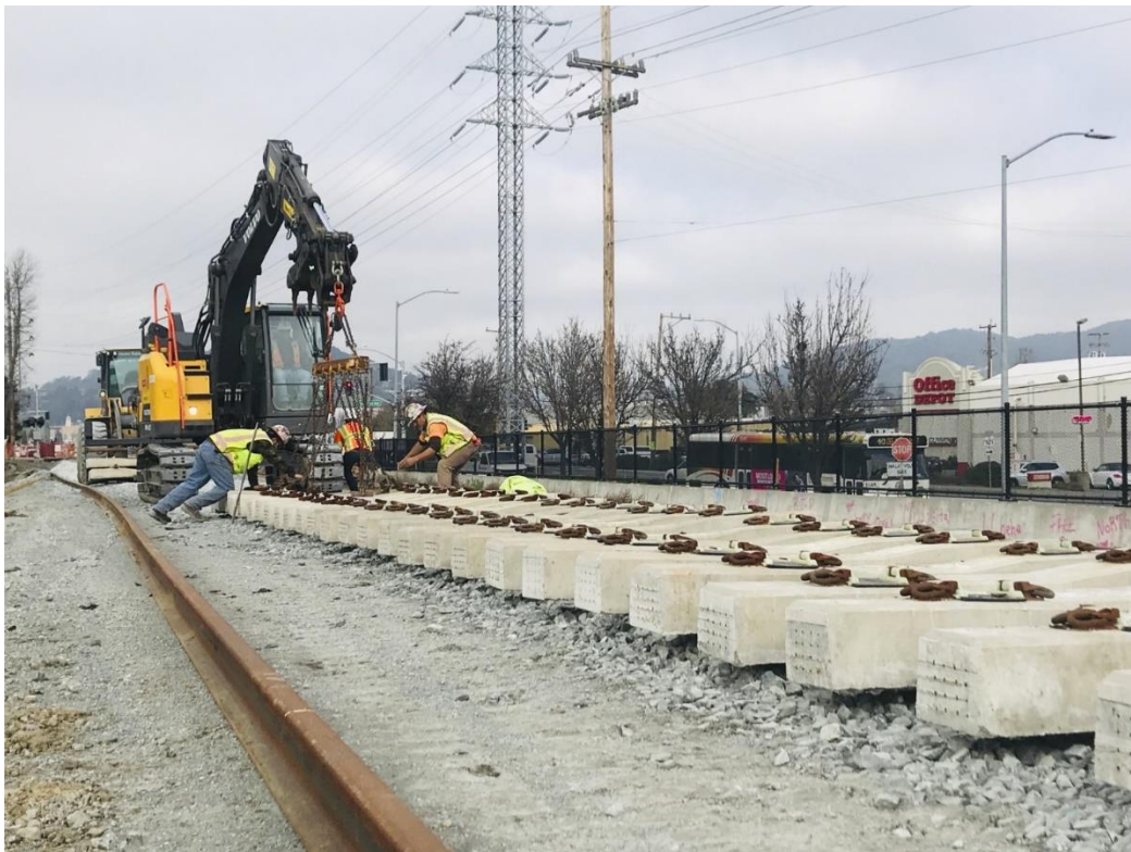
Track construction between Auburn Bridge and Andersen Drive