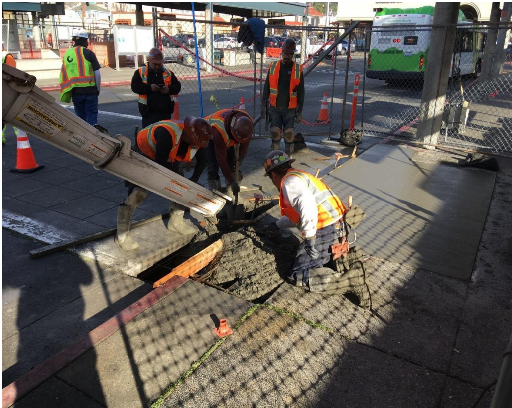
Bettini Transit Center – reconstructing a portion of Platform B