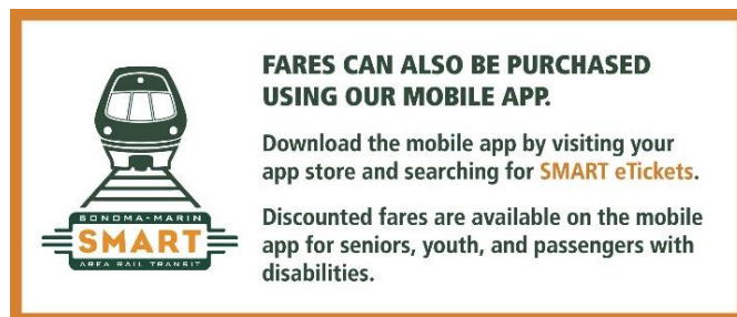
SMART added signage to all of its fare vending machines, located at each SMART station.