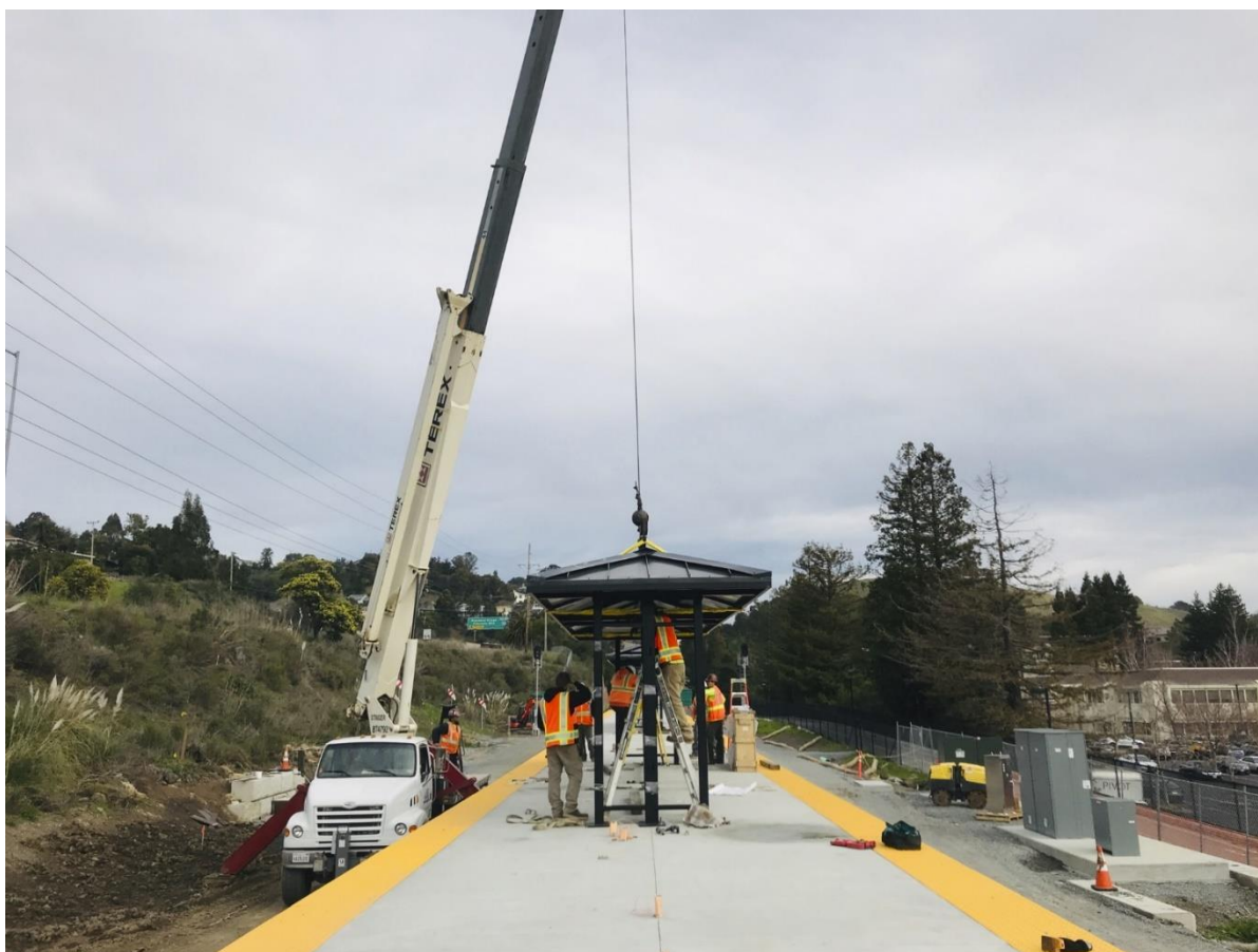
Larkspur Station- Installation of Platform Shelters