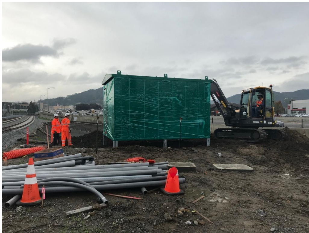
Grade Crossing control house installation at Francisco Boulevard West