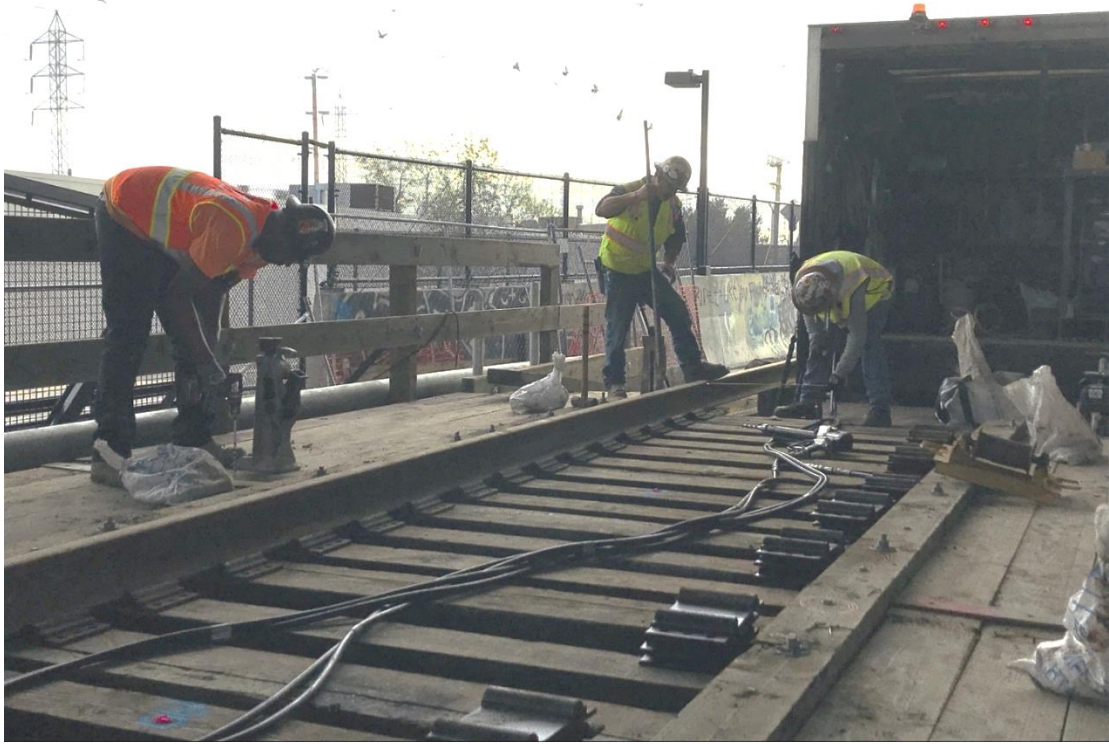
Constructing track across the Auburn Street Bridge