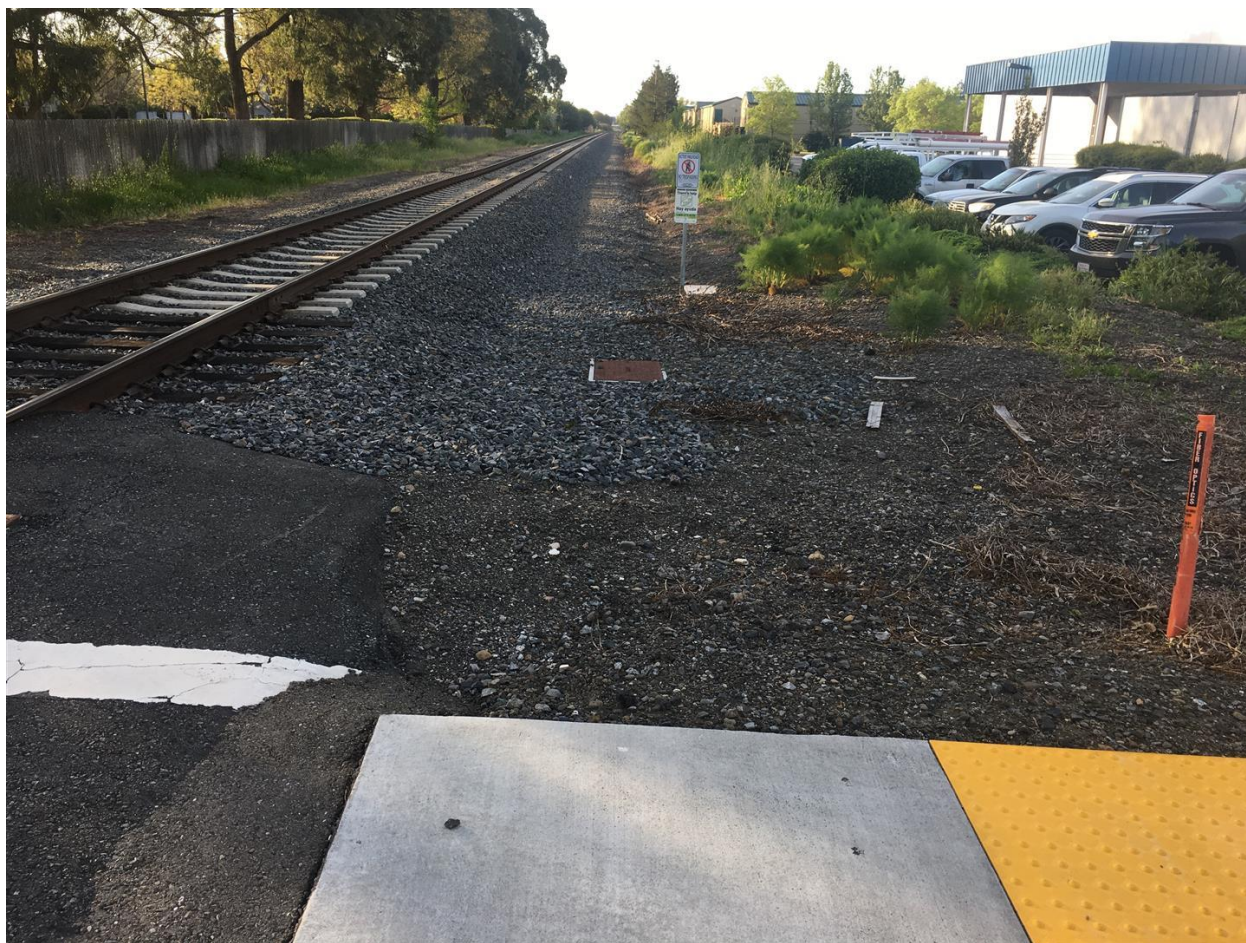
Looking south from Southpoint Boulevard along the pathway route