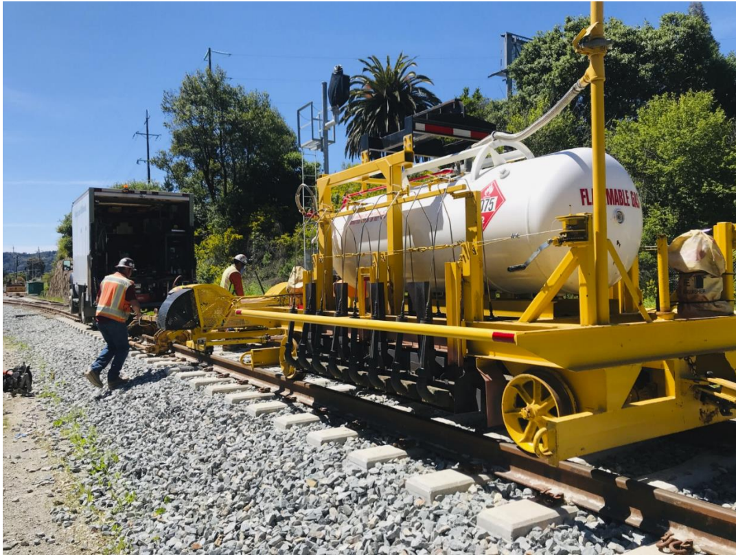
Track construction between Larkspur Platform and Cal Park Tunnel