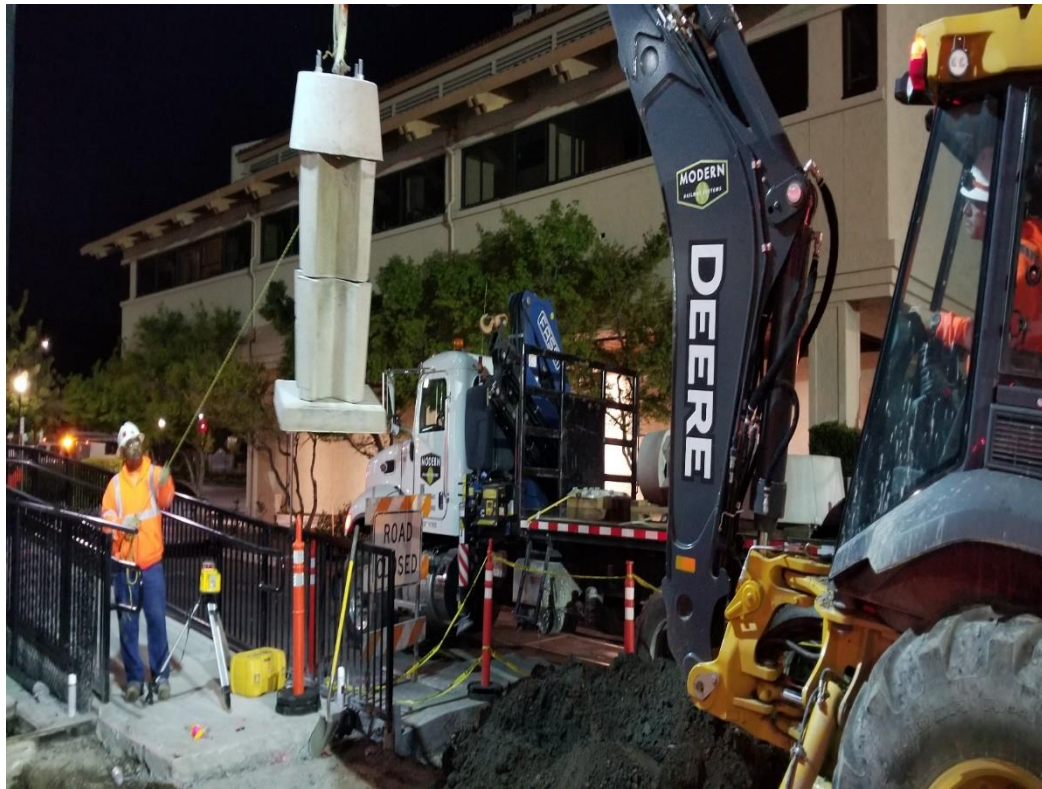
Installation of traffic signal foundation at 3 rd Street.