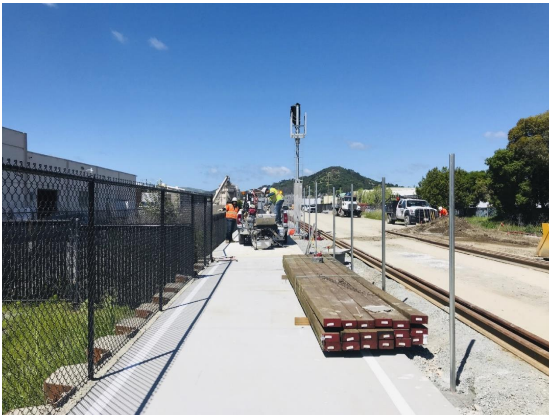
Multi Use Pathway-Pathway construction near Andersen Drive