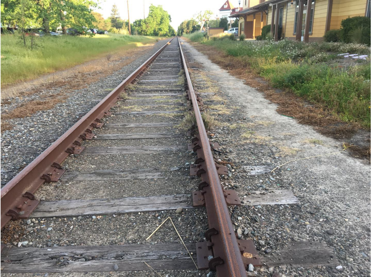
Future Windsor Station platform location