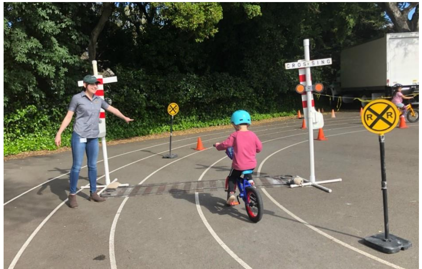
Students at McNear Elementary in Petaluma learn railroad crossing safety as part of SMART's safety outreach program.

Each member of SMART's Communications and Marketing staff is an authorized volunteer for Operation Lifesaver, the leading national rail safety education and awareness organization. In spring, Operation Lifesaver partners with Sonoma County Safe Routes to Schools and local law enforcement to host bike rodeo safety training at local elementary schools. Children are taught basic bicycle safety, which includes railroad crossing safety. SMART volunteers operate the mock gate arms on the safety course and teach students how to safely cross the railroad tracks at designated crossings.