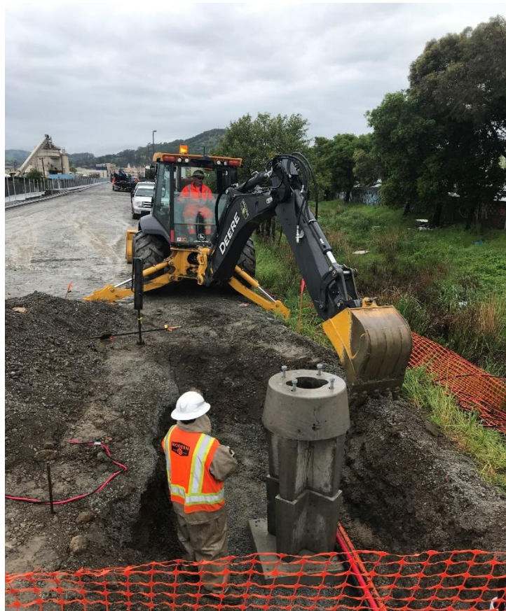
Signal foundation installation at near Rice Drive