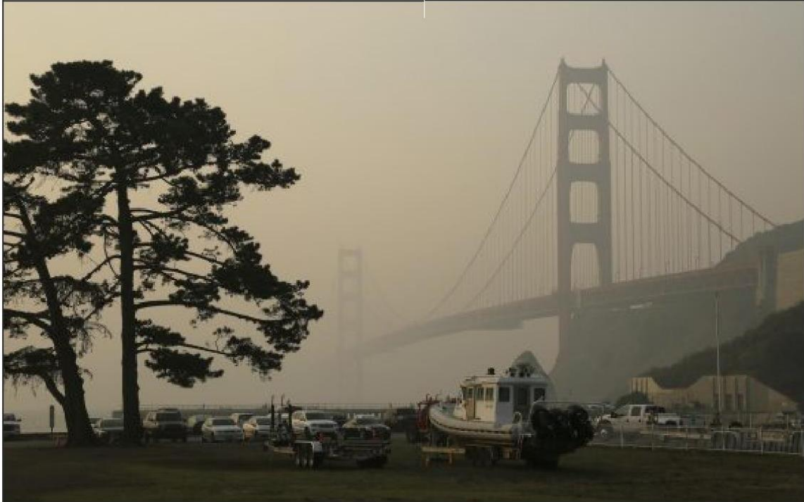
Air Quality During the Camp Fire. Marin Independent Journal dated November 17, 2018.

State urged to take steps to protect public