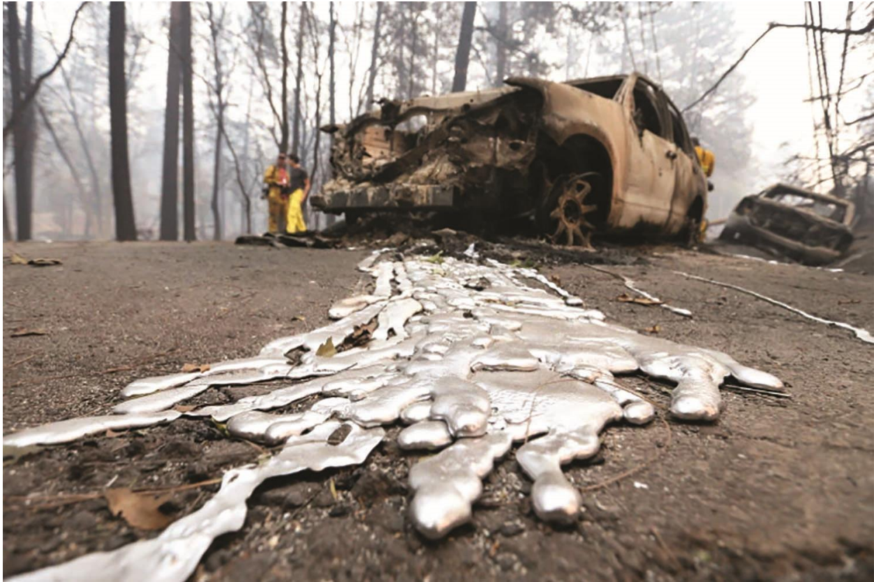
Burned Cars and Melted Aluminum from Engine Block Caused by Extreme Heat in Camp Fire, November 2018. (Jane Tyska/Bay Area News Group) The Mercury News . Published Nov. 13, 2018.

Overhanging trees, thick underbrush, and vegetation that have grown too close to structures also pose serious threats. First responders will bypass evacuated homes that are overgrown by vegetation. Instead, they will move on to homes that have defensible space rather than attempt to save a structure that has none.