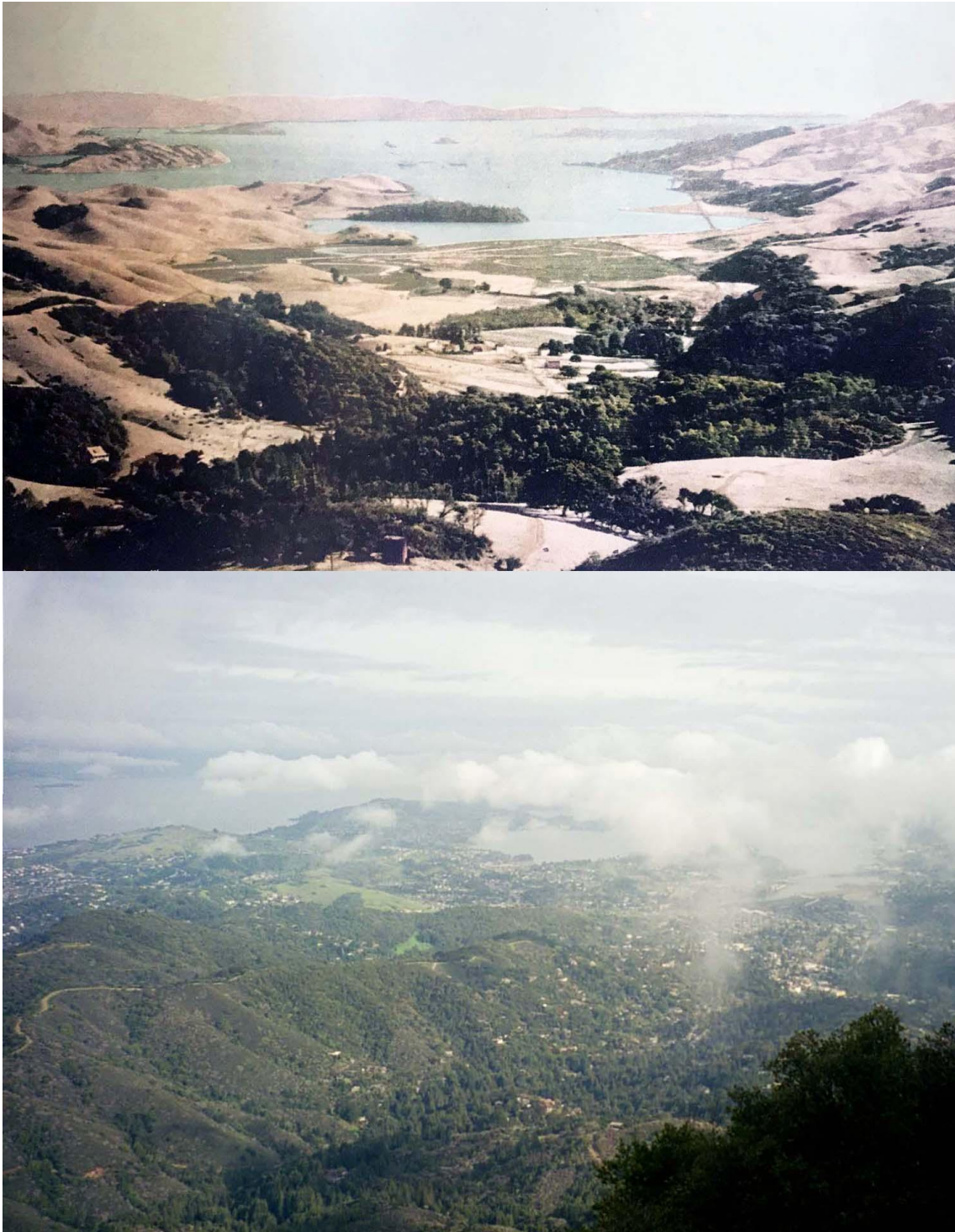
View from Mt. Tamalpais in days gone by (top) and today 2019.

Overgrown vegetation also threatens Marin’s roads and evacuation routes. It narrows these escape routes, many of which will be impassable in a wildfire. As happened in Paradise, panicked Marin residents may try to flee only to find the roads impeded by burning vegetation, fallen trees, downed power lines, and stalled cars with melting engine blocks. 2