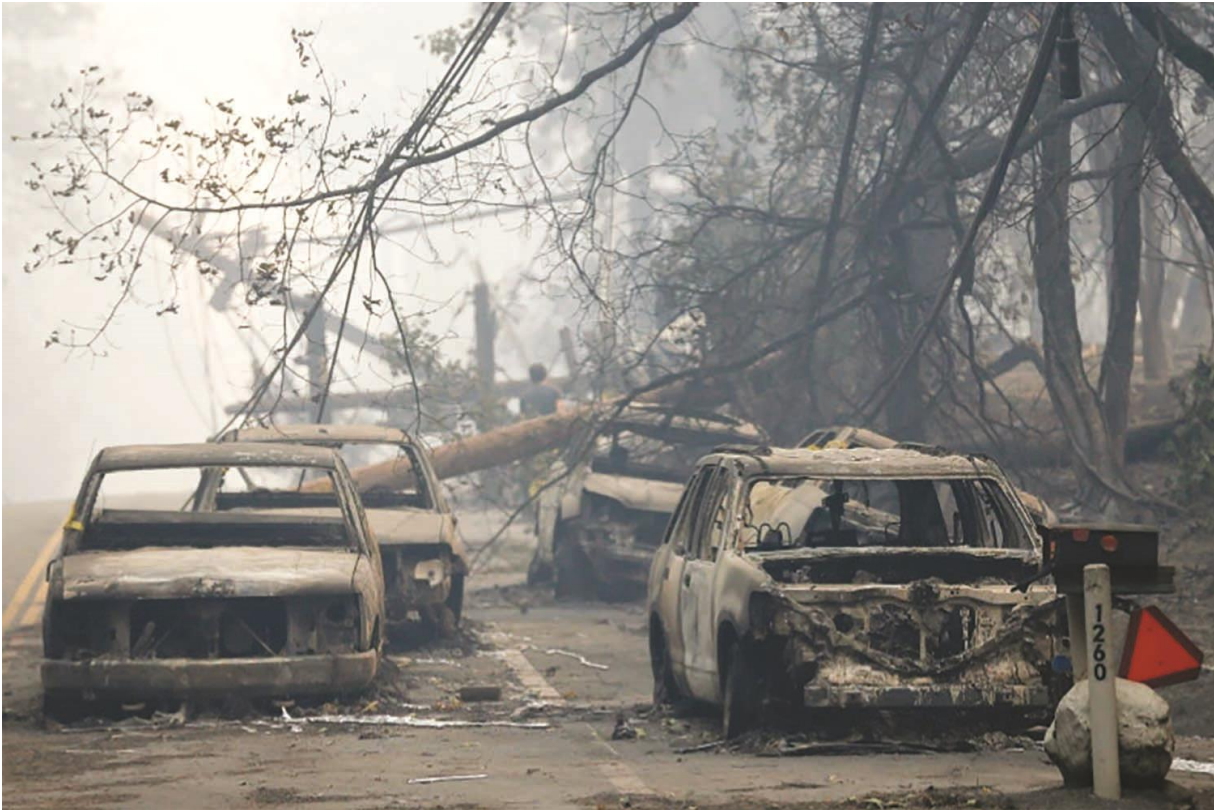
Burned Cars and Downed Power Lines Block Pearson Road in Paradise, California, on Saturday, Nov. 10, 2018. San Jose Mercury News, November 17, 2018.

The Grand Jury visited Paradise in January 2019 to view the disaster. See Appendix F to this report, which compares Paradise’s wildfire preparedness before the Camp Fire with Marin’s current state of preparedness.