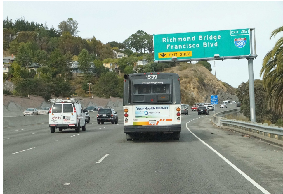
Exit US-101 at Bellam Boulevard