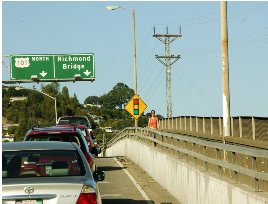
Exit US-101 at East Sir Francis Drake Boulevard