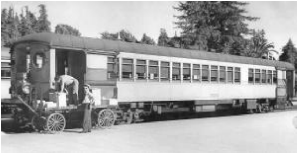
NWP interurban 386, arrived from Sausalito, unloads from the front platform special express shipments at Mill Valley Depot, October 1939. 386 was the last of 12 motors and 7 trailers bought new in 1930. It had only 11 years of service until abandonment in 1941, after which it was transformed to Pacific Electric as No. 4511.

THE TUNNEL'S MILL VALLEY OPENING IS AT THE END OF THE MULTI-USE PATH AFTER IT CROSSES VASCO COURT