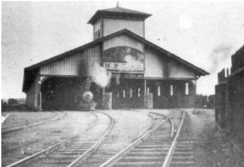
North Pacific Coast four truck train shed was erected on the pier at Sausalito in 1894. 324 feet long and 80 feet wide, big enough to allow passengers to transfer from trains to ferries under cover.

Although it is not expressly stated in the Resolution, it appears that the Council's acceptance of the findings and recommendations of the Feasibility Assessment would depend upon a satisfactory resolution of the issues it has raised.