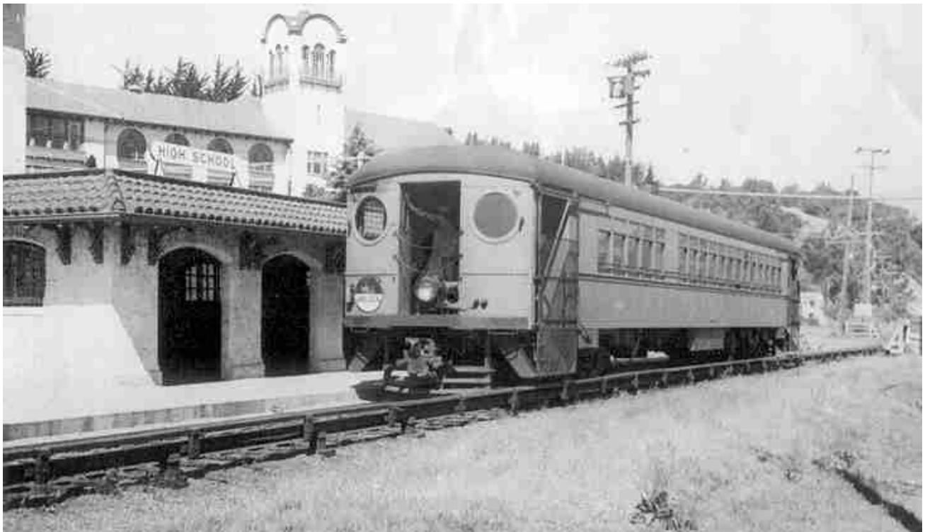
NWP electric passenger motor 383 at High School Station near Mill Valley, July 1937. St. Louis Car Co. 1930. Electric 3rd rail this side of car. Mill Valley Branch electric trains quit on 9/30/40 and the entire NWP interurban system serving San Rafael, San Anselmo and Manor was abandoned 2/28/41.