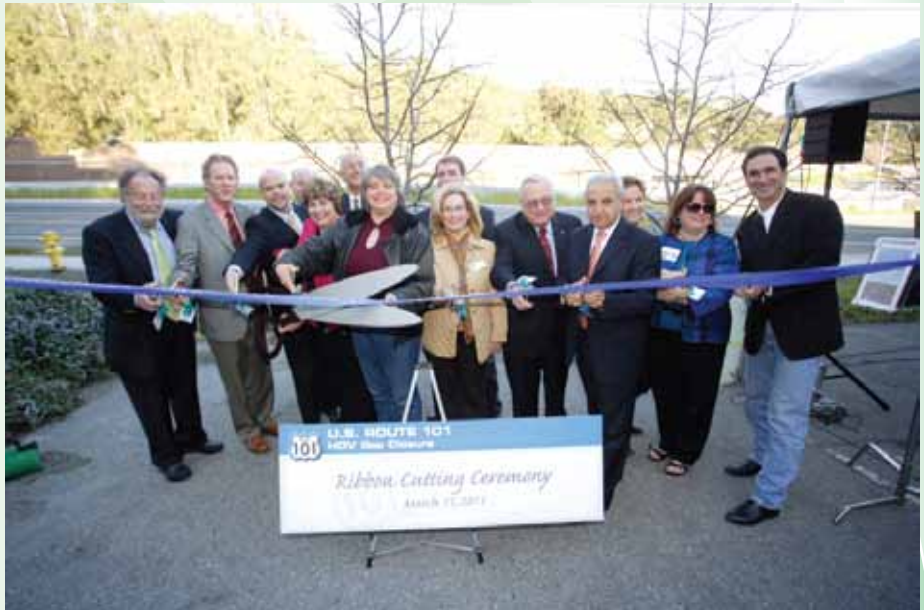
Highway 101 Gap Closure Segment 4 Ribbon Cutting Ceremony, March 11, 2011