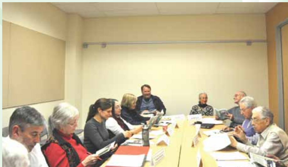
At a Citizens' Oversight Committee Meeting

A: The dedication and support to transportation related issues in the County from all my colleagues on the COC; the very informative discussions we always have during meetings; the value the COC adds to making our government process more transparent and accessible to the public; and the wonderful work and support the TAM staff provides.