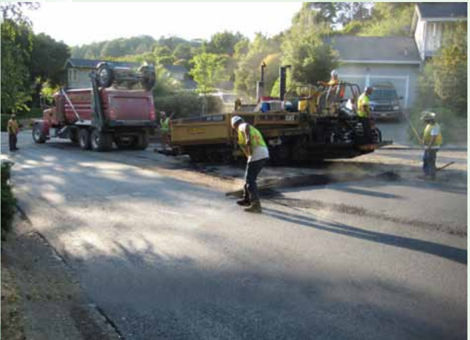
Measure A Road Project in Action

Sir Francis Drake Boulevard in Marin County: The County of Marin is moving forward in a broad and complex technical effort to improve Sir Francis Drake Boulevard through Samuel P. Taylor Park. The final EIR was reviewed and certified by the Board of Supervisors in May 2011 and construction is scheduled to start in July 2012.