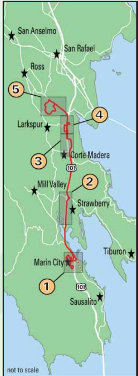
Marin Transit's New Route 222 (Serves Marin City/Transit hub, Strawberry/ Safeway, and Greenbrae/Marin General Hospital)

Throughout the years, public transit has been the preferred local travel alternative in Marin. Voters reaffirmed their support for transit by allocating more than half of the sales tax revenue from Measure A to Marin Transit, the local transit provider. Marin Transit manages five contracts that provide local fixed-route bus and shuttle services, rural transit services (the West Marin Stage), the Muir Woods Shuttle, Dial-A-Ride in Novato, and special needs transportation services. Special needs services include paratransit for disabled residents under the Americans with Disabilities Act, travel training for seniors and developmentally disabled adults, and ensuring the availability of accessible taxis. Dedicated local funding through the sales tax allows Marin Transit to leverage more state and federal funds for its riders. TAM allocated $9.2 million in transportation sales tax revenue to Marin Transit in FY2010-11 to support local transit operations and capital programs. For more information about the services Marin Transit provides and to plan your trip, please visit: www.marintransit.org .