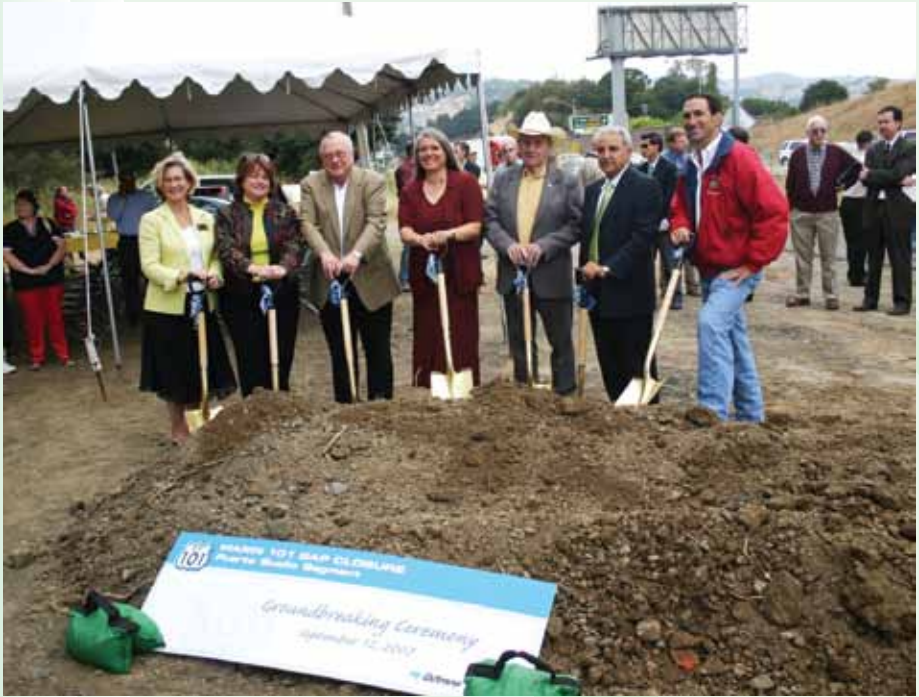
Highway 101 Gap Closure Segment 4 Groundbreaking Ceremony, September 12, 2007

The continuous carpool lane in Marin County along the 101 corridor was made possible through the dedication of more than $25 million of Measure A transportation sales tax revenue. The construction of Segment 4 over Puerto Suello Hill (San Rafael) was completed in December 2010 with the ribbon cutting ceremony taking place on March 11, 2011, marking the completion of the Highway 101 Gap Closure Project. The eight-year project closed the gap between the existing carpool lanes by building two 4.5-mile carpool lanes, one northbound and one southbound.