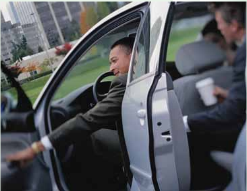
Carpool to Work

“At Bank of Marin, we have a responsibility to the community, our customers, and our employees. We believe active participation in transportation issues is critical and plays an important role in attracting talented employees to our company. We are open to collaborating with other Marin employers on transportation options, such as van pooling.”